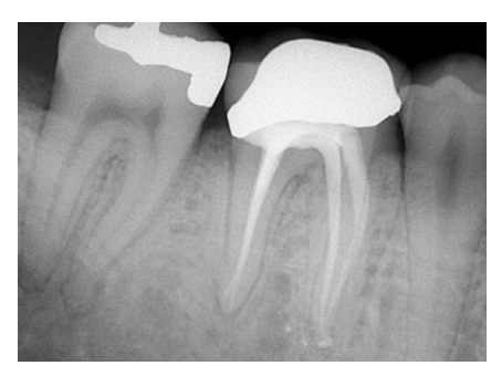
Figure 4. Six months post GentleWave® RCT