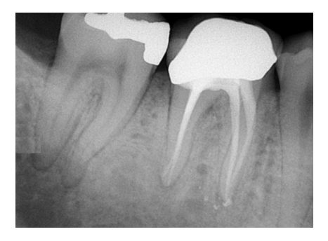
Figure 3. Three months post GentleWave® RCT

At 3 months and 6 months, the tooth was asymptomatic. Radiographically, as shown in Figure 3 and Figure 4, a marked reduction in the size of the periradicular lesion around both the mesial and distal roots was observed. Figure 5 shows the progression of healing at 24 months.