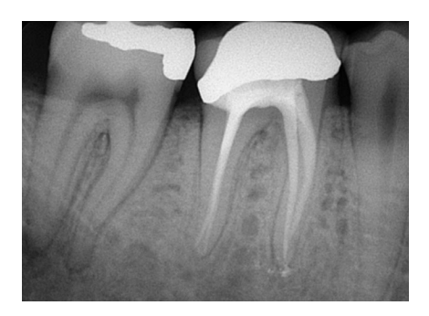
Figure 5. Twenty-four months post GentleWave® RCT