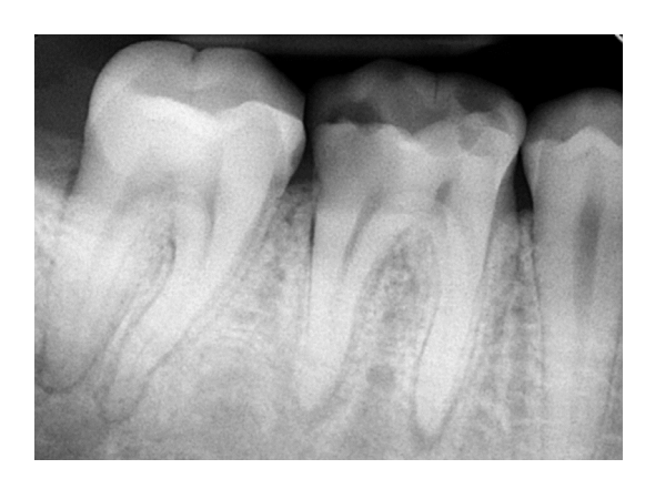
Figure 1. Before GentleWave® RCT

The tooth was prepared for endodontic treatment, accessed conservatively, and the canals were instrumented to #20/.07. The GentleWave® System was used to clean the root canal system. Obturation was performed using warm vertical compaction technique. The subject's tooth is shown in Figure 2 after the GentleWave treatment and obturation.